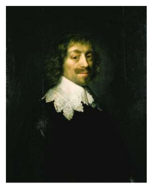
Constantijn Huygens, Michiel van Miereveld, 1641

In 1621 several reprints of Drebbel's essay: "Grondige oplossinge van de Natuer en Eygenschappen der Elementen" - Thorough Solution of the Nature and Characteristics of the Elements — appeared, in which Drebbel described a methodology that gives the impression that he was able to produce oxygen: 'So the body of Saltpeter broken and resolved by the power of fire and so changes into the nature of air'. soo het lichaam des Salpeters gebroken en ontbonden wort, door de kracht des vuers, en alsoo verandert in de natuur des lochts'.