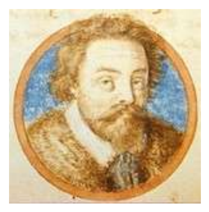
Cornelis Drebbel, Selfportrait, 1623

Was Drebbel's trouvaille a lucky coincidence or did he develop the 'perfect red', because of market demand?